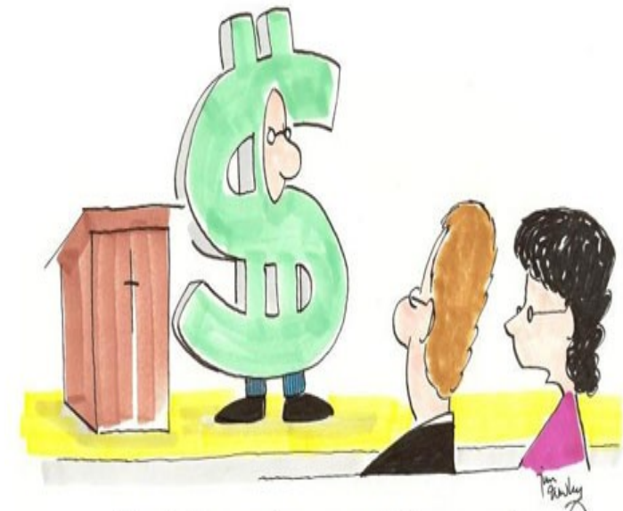
"Looks like another stewardship sermon."